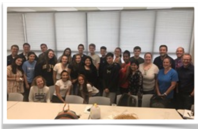
Our 1st group of IB Diploma Candidates!