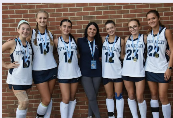
Field Hockey - Section 1 Champions!