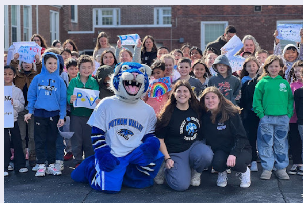
PV attends first-ever NYS Girls Wrestling Championship.

Congratulations to our student-athletes for excelling both on the field and in the classroom! 90% of all varsity teams have been recognized as New York State Public High School Athletic Association Scholar-Athlete Teams!