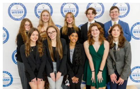
Westchester Engineering and Science Fair (WESEF)

From curiosity in the classroom to recognition on the regional stage, our science research students are making us proud! PVES 4th graders recently showcased their impressive projects at the Tri-County competition, demonstrating a strong foundation in scientific inquiry. At PVHS, our dedicated science research students have earned multiple awards, standing out among top young scientists in the region. Innovation, perseverance, and discovery are thriving at PVCSD!