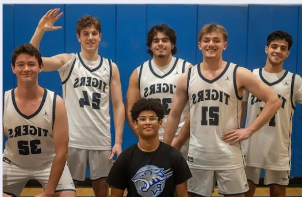
Boys Basketball - League Champions