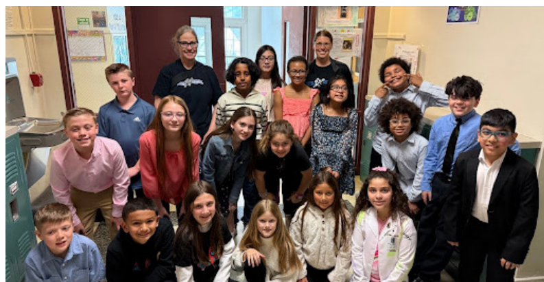
Tri-County Science & Technology Fair