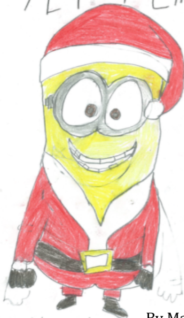
By Mateo Dobra