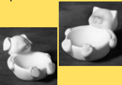
Puppy or Kitty Bowl 7.125"L x 6"W x 3.88"H