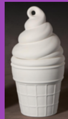
Ice Cream Cone Cookie Jar 12.5"H x 6.5"W