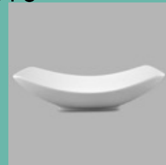
Small Scooped Serving Bowl 9"Lx5.5"Wx2.5"H