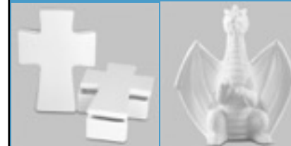
Cross Box or Standing Dragon 5.5"L 4"Hx3.5"H