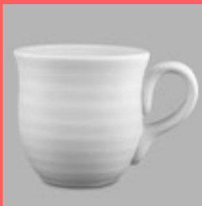
Pottery Mug 4.25"Hx4.5"W